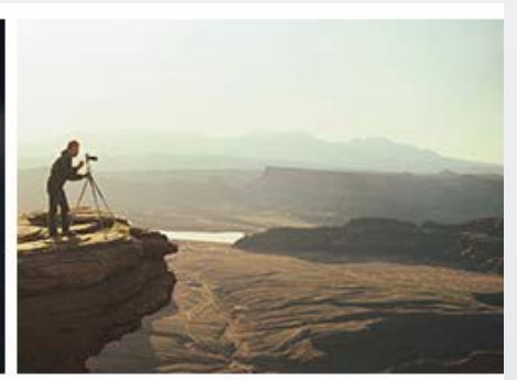
Surveying and mapping