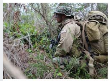
Patrol & reconnaissance